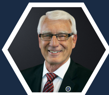
SEN. CURT KREUN